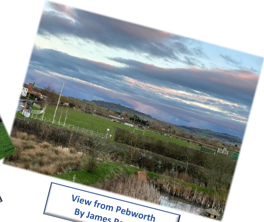
View from Pebworth By James Pearson