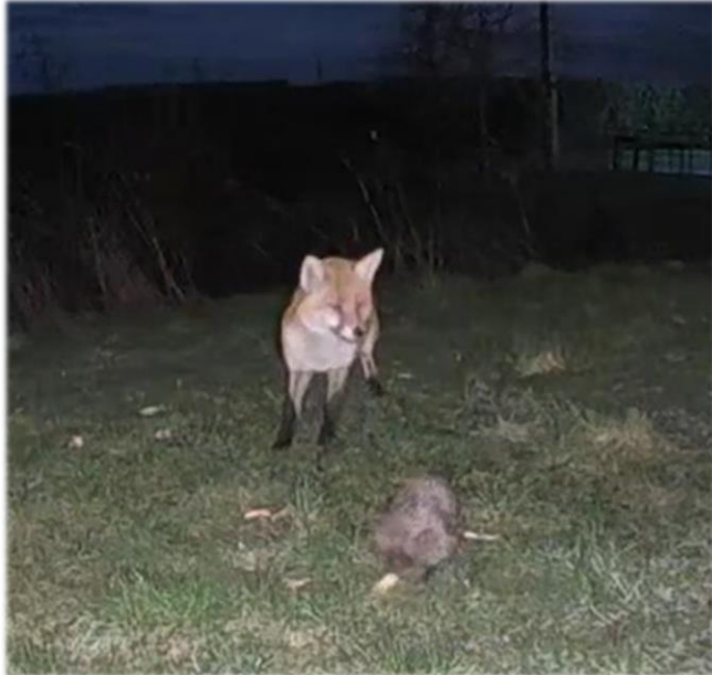
Hedgehog & Fox Dining Together By Les Madden