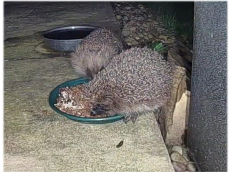
Newly-awakened Hedgehogs Feeding By Les Madden