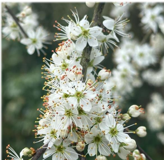
Blackthorn Blossom & Wild Violets By Charlotte Foskett