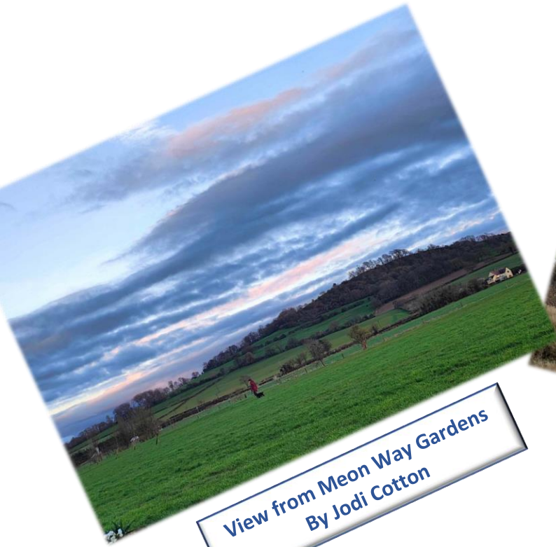
View from Meon Way Gardens By Jodi Cotton