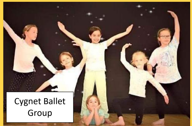
Cygnets Ballet Group

We are encouraging all local talent and all ages to try something, anything.... a bit of fun to bring in Spring! The Children's Section will be in the first half, and the Adults' Section after the interval.